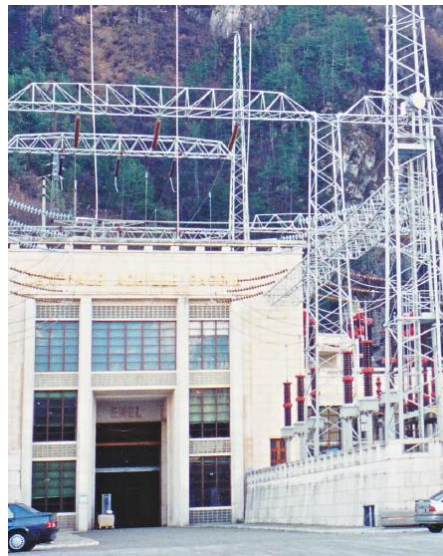
Hydro-Electric Power Station - ENEL, North Italy